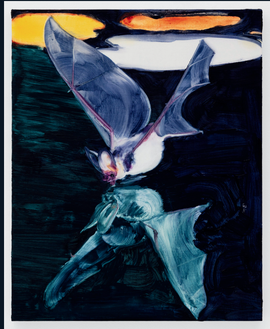
Drinker , oil on panel, 2026.

Dracula, too, had this quality. He took human form, yes, but he also shapeshifted into a bat, and even into a strange mist—all phenomena that you do not want to bump into in the night. He ravaged Europe, from Transylvania to London, feasting on victims' blood and inciting terror. Let us forget the book for a moment: there are over 500 films featuring the character of Dracula, making him the most portrayed literary character in movie history. 4 No wonder our collective perception of bats spills from pop cultural expressions like these. Hell, mine does as well. What Jaws did for sharks, Dracula did for bats.