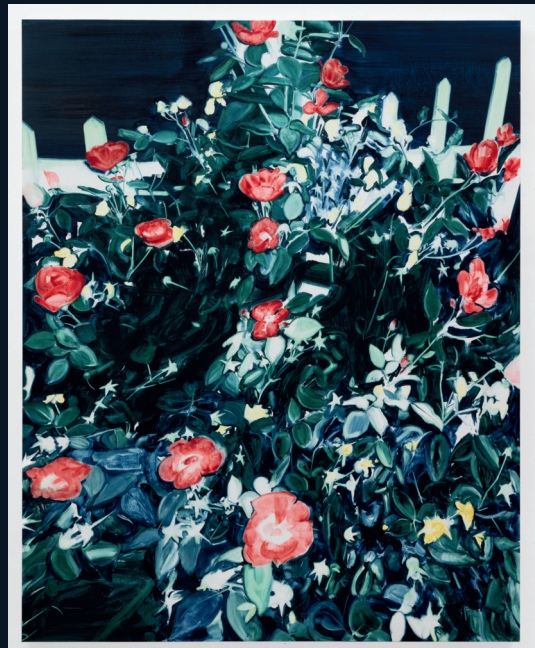
Bramble , oil on panel, 2022.